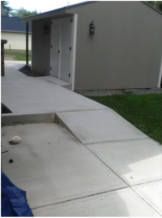
New storage shed with sidewalk