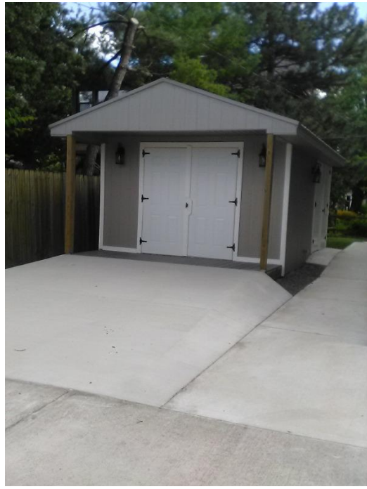
Front view with overhang porch