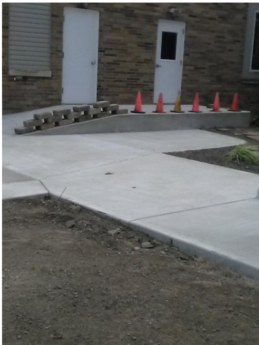
Back entrance with ramp. Railing to be installed.