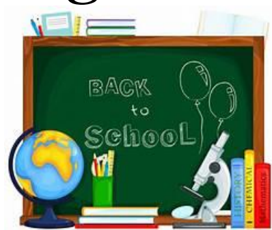
Watch for school children and buses returning back to school.